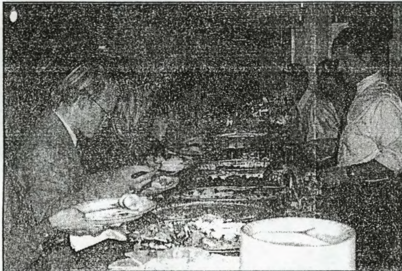
The menu for Arabic Night included stuffed grape leaves, hummus, rice, roasted chicken, leg of lamb, grilled fish and mixed vegetables.

"We said let's have a club for the Middle Eastern community in the