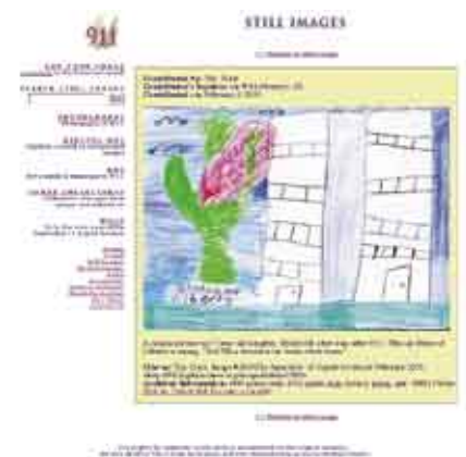
The September 11 Digital Archive allows students to see and hear the accounts of those involved in the 2001 attacks in New York, Pennsylvania, and Virginia.

of and reactions to 9/11 in a variety of media formats including still and moving images, sound files (firsthand accounts and music), and a forum to read and contribute personal reflections on the events. Because of the sensitive and emotional nature of the subject, you should preview the materials included in the archive. In particular, some of the images are graphic and the satirical animations may be offensive to some viewers.