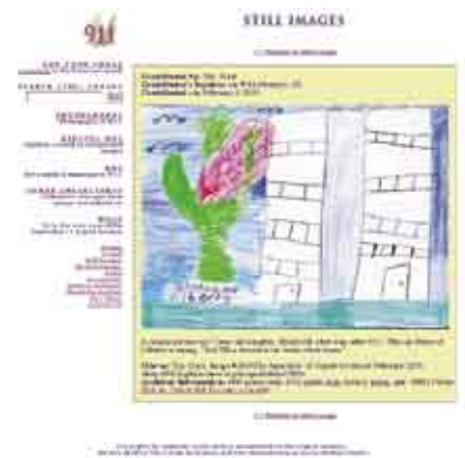
The September 11 Digital Archive allows students to see and hear the accounts of those involved in the 2001 attacks in New York, Pennsylvania, and Virginia.

of and reactions to 9/11 in a variety of media formats including still and moving images, sound files (firsthand accounts and music), and a forum to read and contribute personal reflections on the events. Because of the sensitive and emotional nature of the subject, you should preview the materials included in the archive. In particular, some of the images are graphic and the satirical animations may be offensive to some viewers.