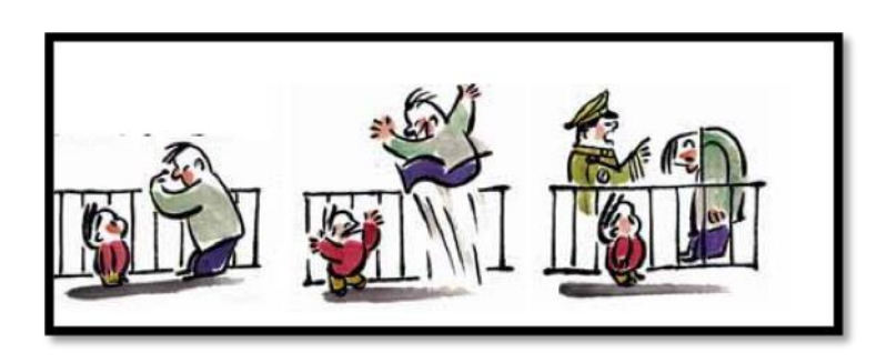
Article 2 Multiple-choice Task