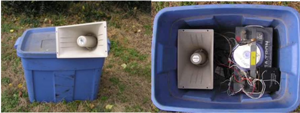
Photos of audio lure components. Photo on left shows components inside plastic container including battery, CD player, amplifier, and bell speaker and connectors. Photo on right shows audio lure in operation with external bell speaker.

Banding began on 25 October 2011 and continued nightly, weather permitting, until 15 December 2011. Nets were opened at a half hour after dusk and closed at a half hour before dawn. Net checks were conducted every three hours thereafter. A net check consisted of driving to all of the stations in the order in which they were opened and checking the nets for captured owls. All owls were placed in a holding box until processed. Until 2006, owls were processed at the College of William and Mary field house, located on the Eastern Shore of Virginia NWR. Since 2006, owls have been processed in the area of the trapping station. After processing, owls were released near the point of capture.