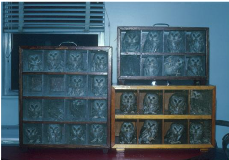
Photo of holding boxes used for transporting owls for processing.

Banding began on 25 October 2011 and continued nightly, weather permitting, until 15 December 2011. Nets were opened at a half hour after dusk and closed at a half hour before dawn. Net checks were conducted every three hours thereafter. A net check consisted of driving to all of the stations in the order in which they were opened and checking the nets for captured owls. All owls were placed in a holding box until processed. Until 2006, owls were processed at the College of William and Mary field house, located on the Eastern Shore of Virginia NWR. Since 2006, owls have been processed in the area of the trapping station. After processing, owls were released near the point of capture.