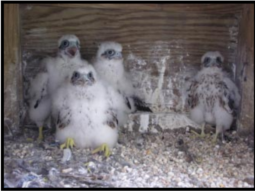
Chicks in nest box on the Benjamin Harrison Bridge.