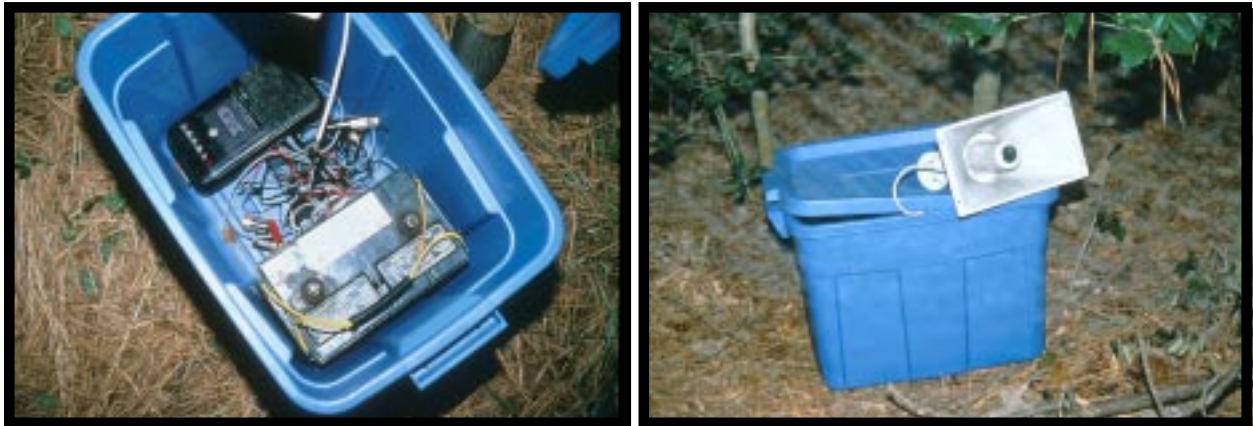
Photos of audio lure components. Photo on left shows components inside plastic container including battery, tape player, amplifier, and connectors. Photo on right shows audio lure in operation with external bell speaker.

A continuous line of 6 mist nets was erected along an east/west axis at each trapping station. Mist nets were 12 m long by 2 m tall and were made of 61 mm, black nylon mesh. An electronic audio-lure was situated at the center of each net lane to attract migrating owls. Audio-lures consisted of a cassette tape player, amplifier and loud-speaker. A continuous broadcast of a Saw-whet “advertising call” was played (Cannings 1993). The effectiveness of audio-lures has been demonstrated by increased capture rates over passive trapping (i.e. trapping without an audio-lure) at other owl banding stations in the United States. Capture rates are increased 5 to 10 fold when an audio-lure is used (Erdman, personal communication ). It should be noted that this technique may exaggerate sex ratios (Whalen and Watts 1999).