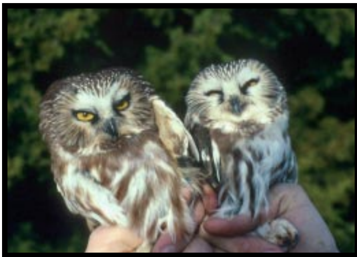
Photo of hatching-year female (left) and after-hatching-year male.

Age ratios in 2001 were 78.8% hatching-year birds and 21.2% after-hatching-year birds. This age ratio is consistent with the invasion years of 1995 and 1999 (Table 3). However migration volume was less than half of that documented in 1999 and just over one quarter of that in 1995.