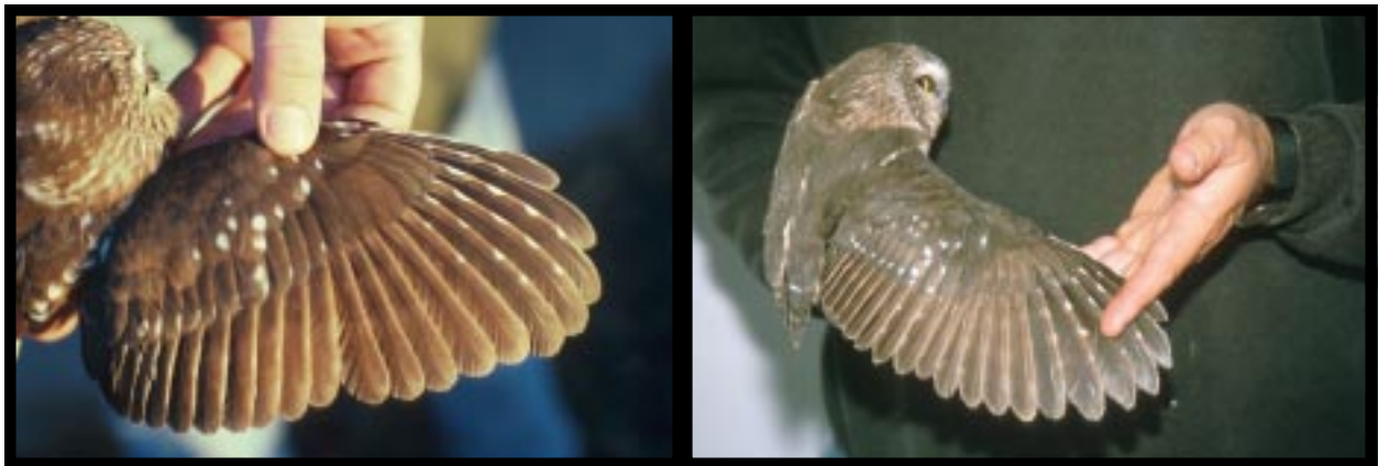
Bird (left) showing typical hatching-year plumage pattern with a single generation of light brown feathers. Bird (right) showing one of several after-hatching-year plumage patterns. This individual illustrates a typical second-year pattern with new outer primaries and retained inner primaries.

Owls were banded with U.S. Fish and Wildlife Service aluminum tarsal bands. Wing chord measurements were recorded to the nearest millimeter and mass was recorded to the nearest gram. Wings were inspected for evidence of molt to determine age according to criteria established by the U.S. Fish and Wildlife Service (Anonymous 1977). Saw-whet Owls were aged as hatching year (HY) if all primary and secondary remiges and coverts appeared uniform in color or as after hatching year (AHY) if primary and secondary remiges were not uniform in color, indicating the presence of more than one generation of feathers.