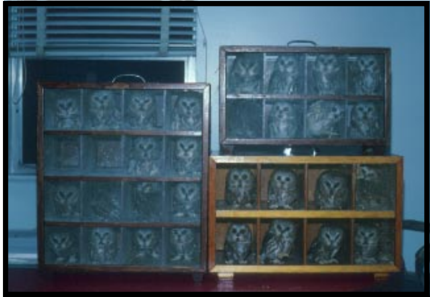
Photo of holding boxes used to transport owls to field station for processing.

Owls were banded with U.S. Fish and Wildlife Service aluminum tarsal bands. Wing chord measurements were recorded to the nearest millimeter and mass was recorded to the nearest gram. Wings were inspected for evidence of molt to determine age according to criteria established by the U.S. Fish and Wildlife Service (Anonymous 1977). Saw-whet Owls were aged as hatching year (HY) if all primary and secondary remiges and coverts appeared uniform in color or as after hatching year (AHY) if primary and secondary remiges were not uniform in color, indicating the presence of more than one generation of feathers.