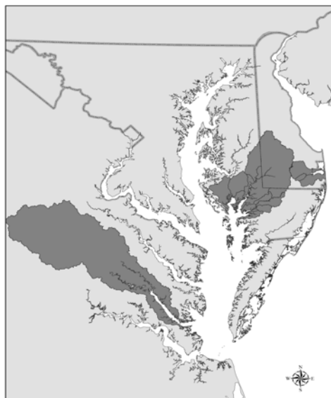
Figure 1. Highlighted watersheds of the York, Nanticoke and Indian Rivers.

This project is designed to provide the Virginia Marine Resources Commission (VMRC), Virginia Department of Environmental Quality (DEQ), Delaware Department of Natural Resources and Environmental Control (DE DENREC), Maryland Department of Natural Resources (MD DNR) and the Maryland Department of the Environment (MDE) with the ability to report the current extent and condition of estuarine wetlands of three major, tidal river systems of the Delmarva. We have developed a multi-level (Level I, Level II and Level III) tidal wetland inventory and assessment methodology for the Delmarva using the estuarine segments of the York River, Virginia, Nanticoke River, Maryland and the Indian River, Delaware as our project watersheds (Fig. 1). This report outlines the development and implementation of this multi-level approach to tidal wetland inventory and assessment along with the utilization of these data by the aforementioned state environmental programs. It is intended that this multi-level approach can serve as a prototype for expanded investigations into other watersheds in the future.