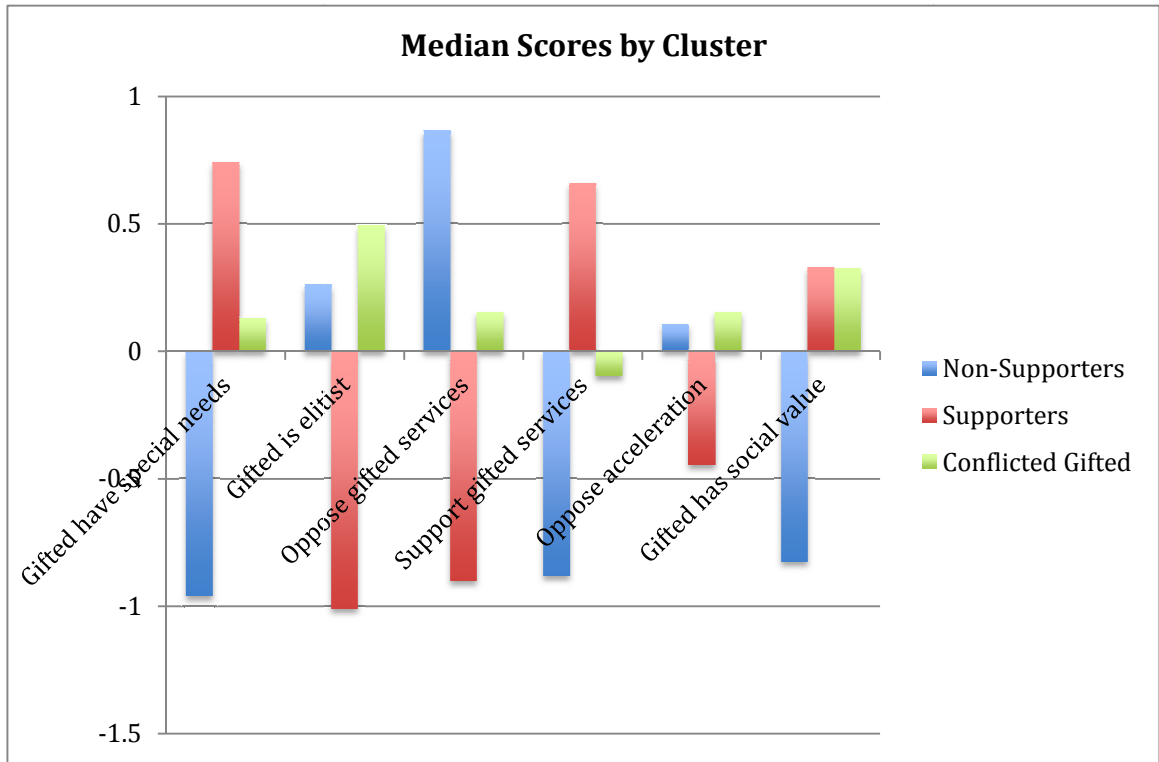
Figure 2. Median factor scores for each cluster.

Because the data were not normally distributed, the Kruskal-Wallis nonparametric test was used to test differences in the scores. The cluster number was the independent variable and the Needs, Elitism, Oppose, Support, Acceleration, and Value factor scores were the dependent variables. Mean ranks were significantly different for all factors (see Table 5).