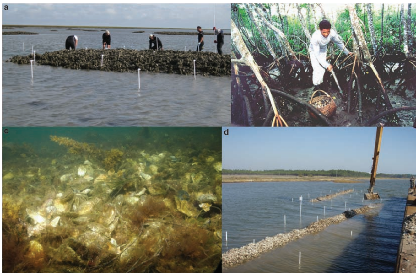
Figure 3. Oyster ecosystem services. (a) Light sensors deployed at low tide to measure filtration and changes in water clarity over a restored oyster reef in Virginia. (b) Oysters being gathered in a mangrove forest in Brazil. (c) Oyster reef restoration in progress to measure shoreline protection in Alabama. (d) Habitat provided by the Australian flat oyster in Tasmania, Australia.

and sport fisheries (e.g., Lipton 2004). Although there is increasing recognition that shellfish provide multiple ecosystem services, management for objectives beyond harvest has not yet become widespread.