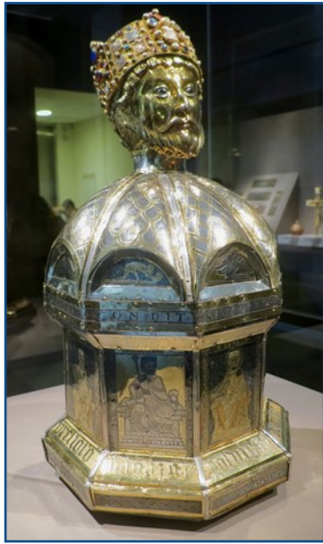
Reliquary of St Oswald, c 1185-89, restored partially 1779

Photo by Karl Steel at www.flickr.com/photos/medievalkarl/10005491294 . Creative commons attribution non-commercial sharealike 2.0