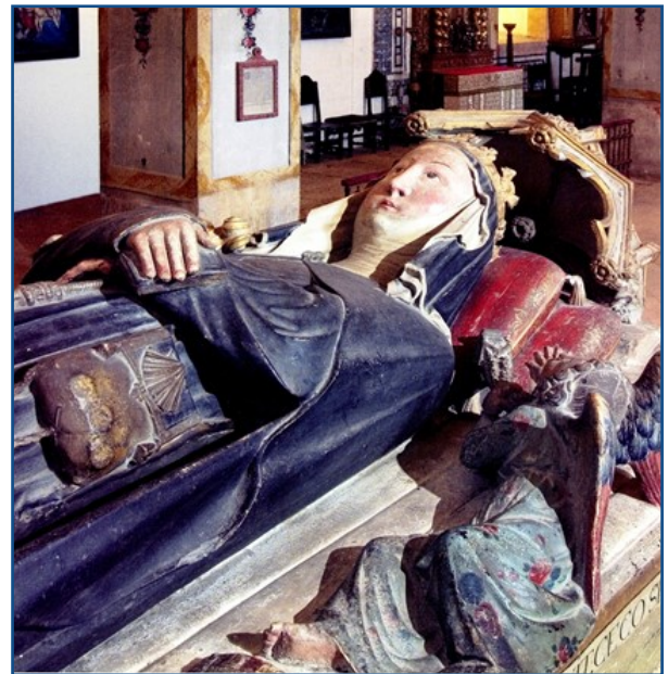
Tomb of St. Isabel of Portugal dressed as a Pilgrim in the New Convent of St. Claire, Coimbra.

human fragments of bone which have never been displayed to the public, while the reputed hand of St. James kept in Reading, England is mummified, a halfway stage between corrupt and incorrupt.