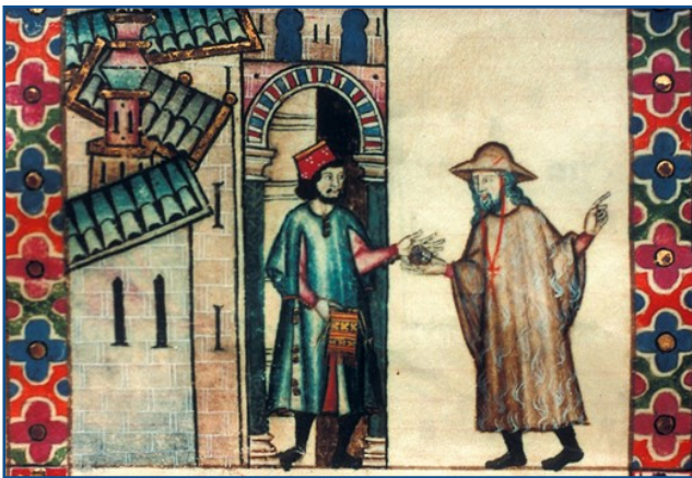
Cantigas de Santa Maria of Alfonso X el Sabio (1221-1284), Código Rico, Cantiga 144, panel b

Because of social constraints and the dangers of travel, medieval pilgrims were overwhelmingly male, yet the women of that period who did make sacred journeys shared all of the bodily experiences described in these pages. There were some stark differences in the heightened risks of attack and not unrelated vulnerability to charges of sexual disrepute women endured. One curious aspect of the pilgrim's body before the law (and of canon law in particular) was the traveller's 'degendered' state: