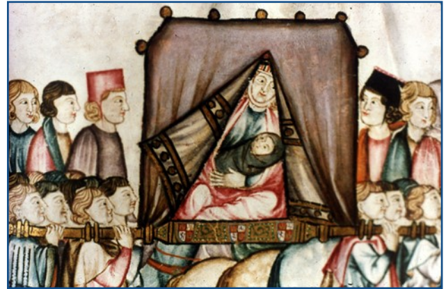
Queen Beatriz of Swabia, mother of Alfonso X, takes her infant daughter Berenguela to the monastery of Las Huelgas in Burgos hoping for a cure

The cure was granted and the daughter presented to the convent as a votive offering.