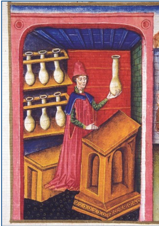
BN-Paris MS 36, f. 97v, ca. 1472. A diagnostician holds a matula, a flask for examining urine samples from his patients.