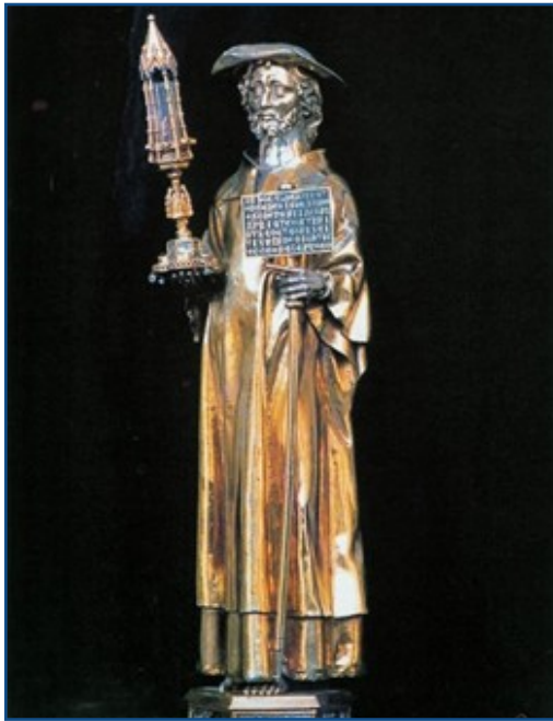
Gothic statuette of St. James the Pilgrim with a tooth of St. James (the Younger?) presented by Gaufridus Coquatrix.

The inscription reads 'In hoc vase auri quod tenet ista imago / est dens b[eat]i iacobi / Ap[osto]li que Gaufridus Coquatrix ci-/vis par[isiensis] dedit huic ec-/clesie orate pro eo.' ('In this golden vessel held up by this statue, is a tooth of St. James the Apostle that Gaufridus Coquatrix, berger of Paris, gave to this church, pray for him.').