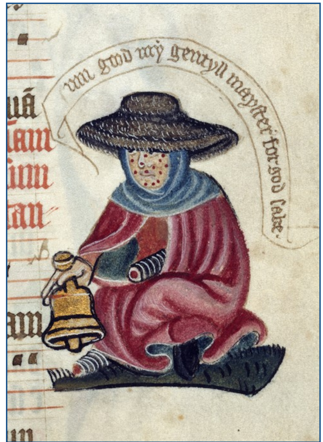
British Library, Pontifical (c.1400), BL Lansdowne MS 451, f. 127.

Medieval pilgrimage was a concentrated exposure to a world of broken limbs and diseased flesh. It was axiomatic in the Middle Ages that the rich had doctors and the poor had pilgrimage, so the stream of travellers struggling to reach their shrines was often a spectacle of suffering that evoked both pity and revulsion. At the entrance to many major towns were hospitals dedicated to Saint Lazarus, charitable leprosaria that isolated travellers who were barred from entering the city. That disease in particular brought a double burden since it had no known cure or treatment and was widely and erroneously presumed to be a venereal infection. A cure through the intervention of a saint – an outcome rarely documented in the Middle Ages – was a leper's only hope. [13]