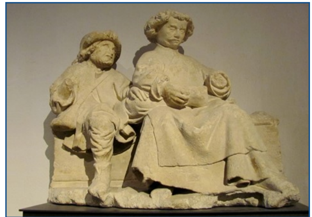
Musée Gadagne, Lyon, France

Modes of travel altered medieval pilgrims' senses of their body in motion. Those who walked to Rome or Santiago – or countless other shrines in Western Europe, tombs and chapels that took them either a few hours away or several years absent from home – felt every step they took. Pilgrims' intimacy with exhaustion, injury, exposure, and hunger would extend to their beasts if they took any, and certainly to the human companions who shared their provisions, apprehensions, illnesses, and lice. [2] A common tongue was hardly guaranteed, although Western Christendom could fall back on the universality of Latin in all