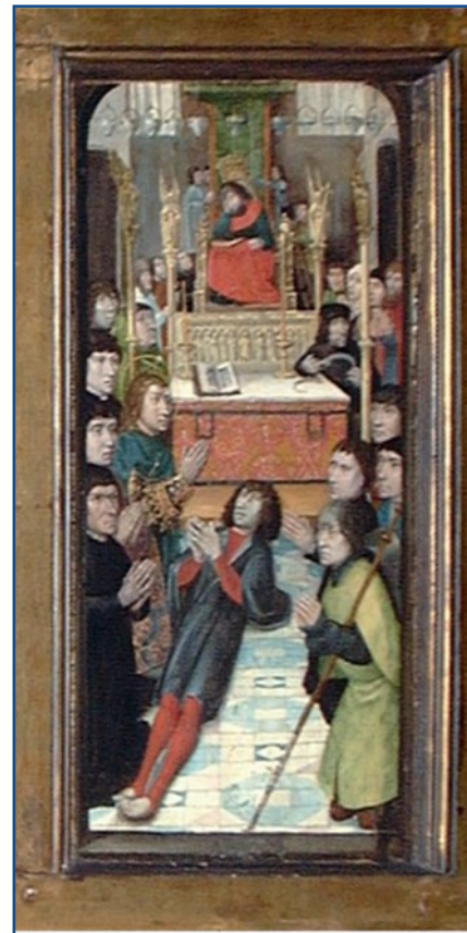
Miracles of St. James, Master of the Legend of St. Godelieve, Flemish, ca. 1500.

Indianapolis Museum of Art, Wikimedia Commons