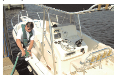
Proper fueling is necessary to prevent drips from fuel docks and to maintain water quality.

To help states meet the requirements of this pollution program, NOAA and EPA have created a Clean Marina Initiative that is both voluntary and incentive-based. Marina operators and boaters are encouraged to protect coastal water quality by using environmentally sound operating and maintenance procedures.