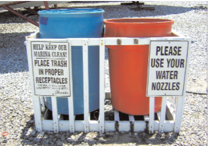
Signs like these are becoming increasingly more common at marinas as they do their part to protect the environment.

But the federal government is, and always has been, involved in the national efforts to keep our marinas clean. Specifically, the National Oceanic and Atmospheric Administration (NOAA) and the Environmental Protection Agency (EPA) share the responsibility of protecting our coastal waters from polluted runoff. Through the Coastal Nonpoint Pollution Control Program, these agencies are coordinating their efforts to establish management measures for all coastal states to use in controlling nonpoint source pollution. These measures are designed to prevent or reduce runoff from a variety of sources, including marinas. Clean marinas remain among the top priorities that receive national and state attention and funds.