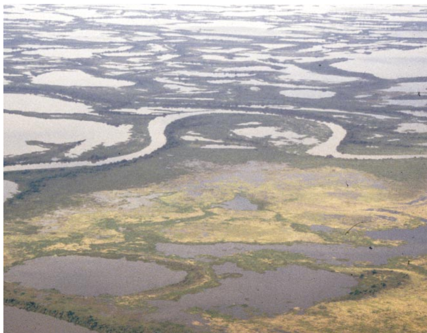
Aerial view of the Paraguay floodplain in the northern Pantanal.

Independent of the CIH assessment, Ponce (1995) focused on the hydrologic aspects of the proposed Paraguay–Paraná waterway in research sponsored by the Mott Foundation.