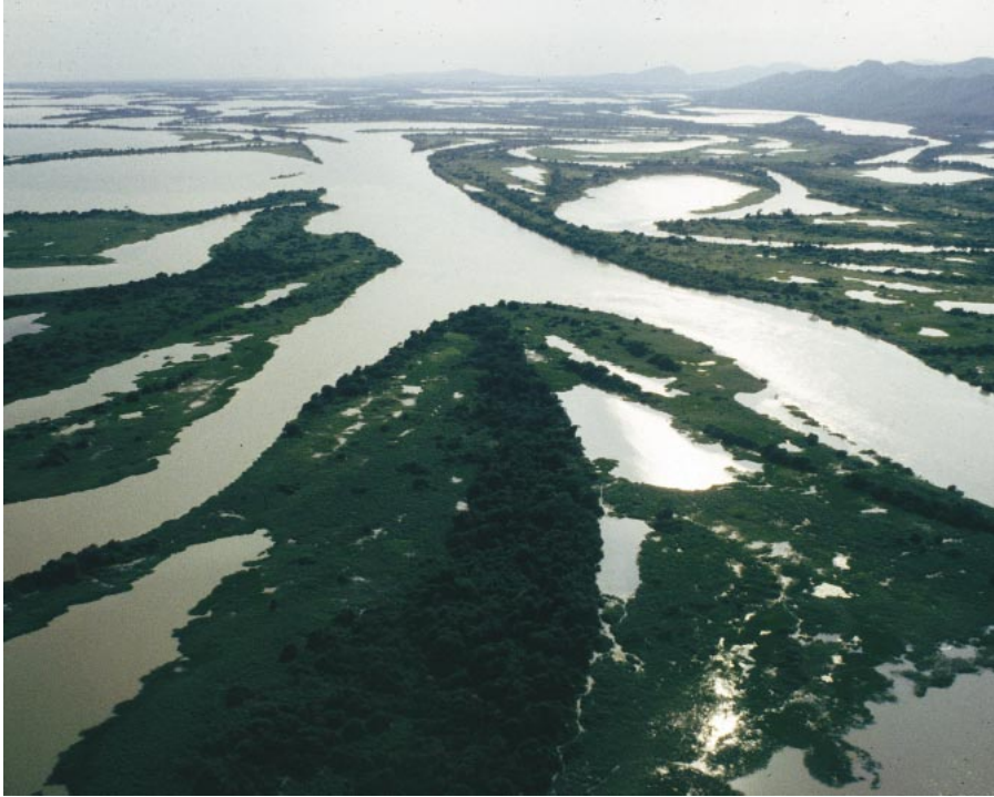
Confluence of the Paraguay and Cuiabá rivers near Acurizal.

The panel's findings were similar to the conclusions reported independently by Hamilton (1999). He used a model to predict that seemingly minor decreases in river levels might cause large losses of flooded area, particularly during the dry season, when such areas serve as critical refuges for fauna that depend on aquatic environments. For instance, lowering the level of the Paraguay River by an average of only 25 cm—certainly a realistic estimate of potential effects of the Hidrovía—would reduce the flooded area of the Pantanal by 22% at low water.