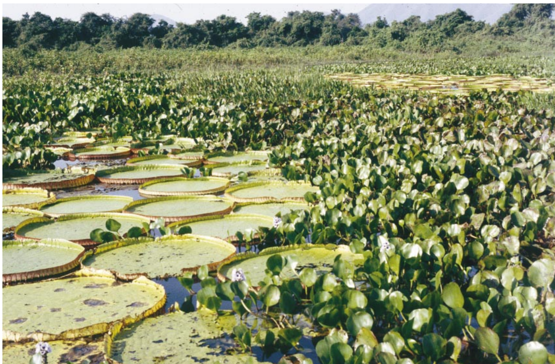
Marsh vegetation, including the water hyacinth ( Eichhornia crassipes ) and the giant water lily ( Victoria amazonica ).

centuries, may suffer greatly if grazing lands receive less flood water (and thus less nutrients) during the rainy season. Environmental costs were not fully assessed (Filho and Coelho 1997). In some ways the analysis echoed assessments made when many of the world's large rivers were developed into complex waterways—namely, the CIH analysis underestimated the long-term costs associated with environmental degradation (Sparks 1995). Only in the last couple of decades have the enormous environmental costs of such development—erosion, flooding, chemical contamination, and disruption of natural communities—become obvious.