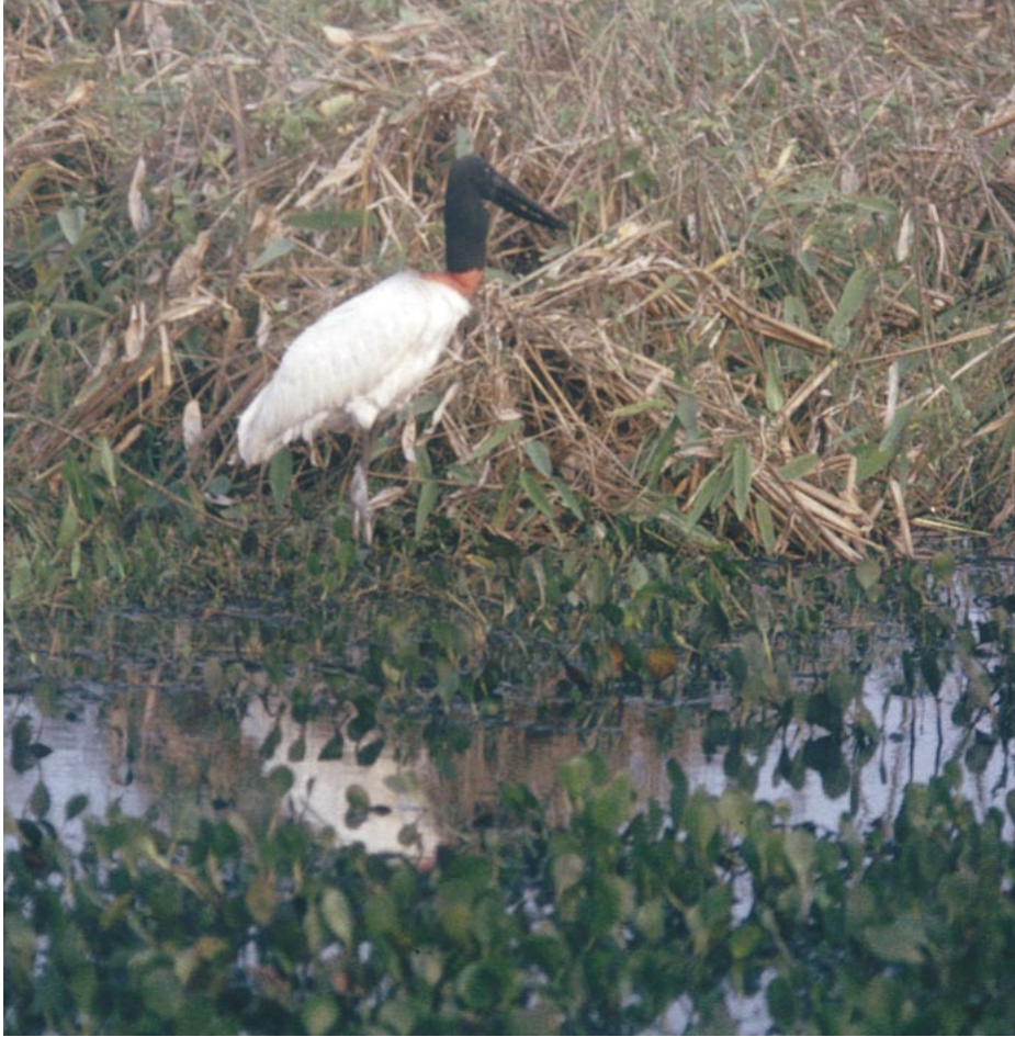
A jabiru (Jabiru mycteria), symbol of the Pantanal, feeding in a shallow flooded area.

Paraná Hidrovía, on the other hand, point to the tremendous long-term costs that these same projects have engendered, particularly in terms of what economists call externalities. These costs (monetary and otherwise), borne by someone other than the individuals using a resource, include flooding, deteriorating quality of drinking water, displaced populations, pollution, loss of wetlands and wildlife, and damage to fisheries (Bucher and Huszar 1995).