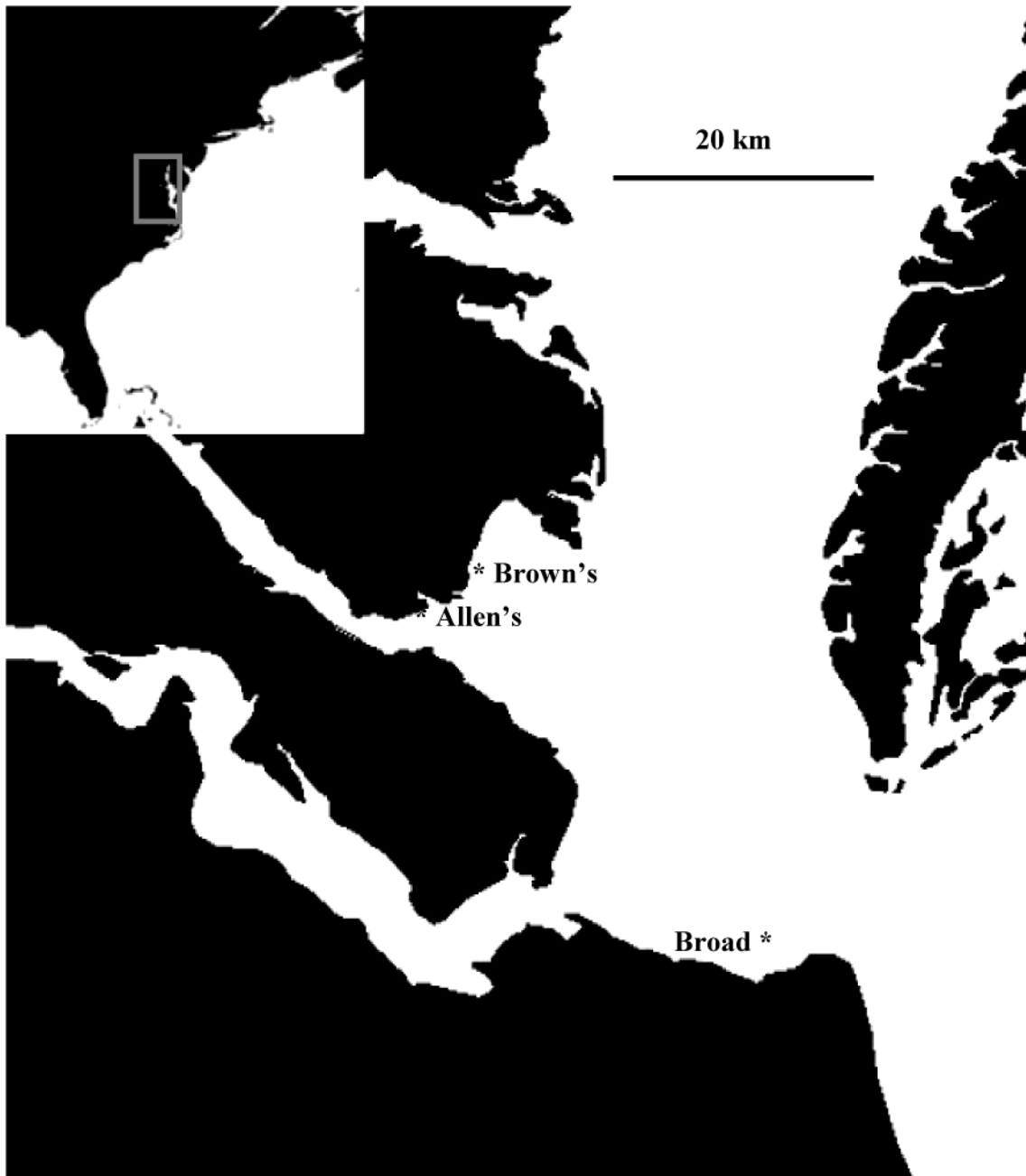
Fig. 1. Map of southern Chesapeake Bay, Virginia, USA. Sites from which plants for artificial crosses were taken are labeled.

between mating type means was calculated for each resampling run. The observed difference between means was then compared to the distribution of resampled values to calculate the probability of obtaining the observed value by chance alone. Because three pairs of means were compared using the resampling analyses, a P value of 0.05/3 , or 0.0167 , was used as the critical value for statistical significance.