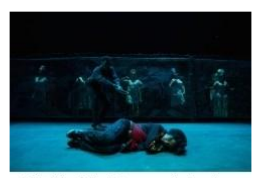
"Ole Ship of Zion," Crowns musical number, William and Mary Theatre [Click to zoom]