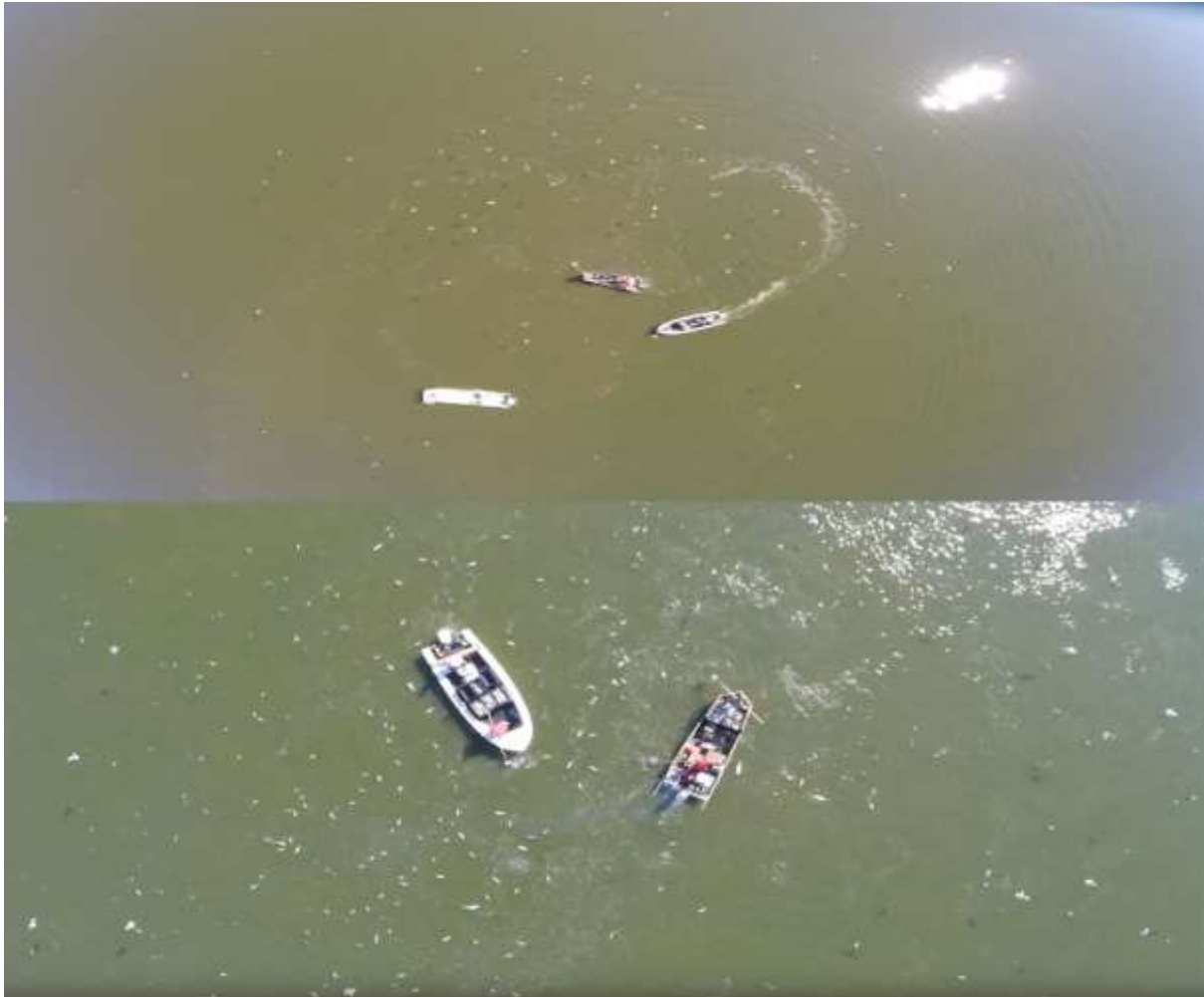
Figure 3. Aerial photos of commercial LFE blue catfish on the James River illustrating the effective field diameter and number of stunned fish during a single electrofishing episode.