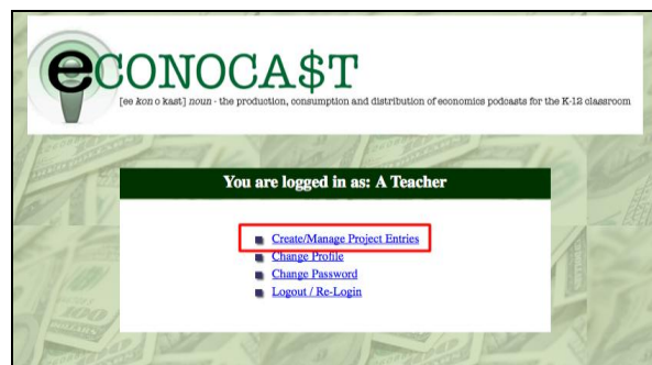
Figure 3. Create a podcast.

In order to create their own Econocast podcast projects, teachers must request a user account for the site from the Producers page on the site. Once logged in, the teacher would click on the “Create/Manage Podcast” button (see Figure 3).