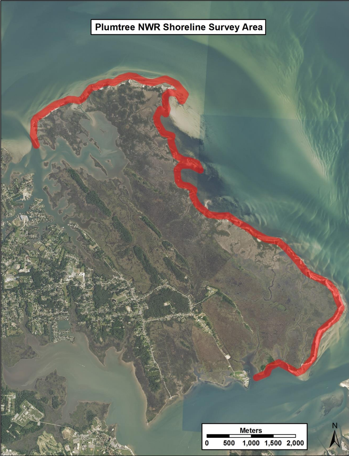
Figure 1. Map of the 100-m wide band transect positioned along the outer shoreline of Plum Tree Island to conduct bird surveys.