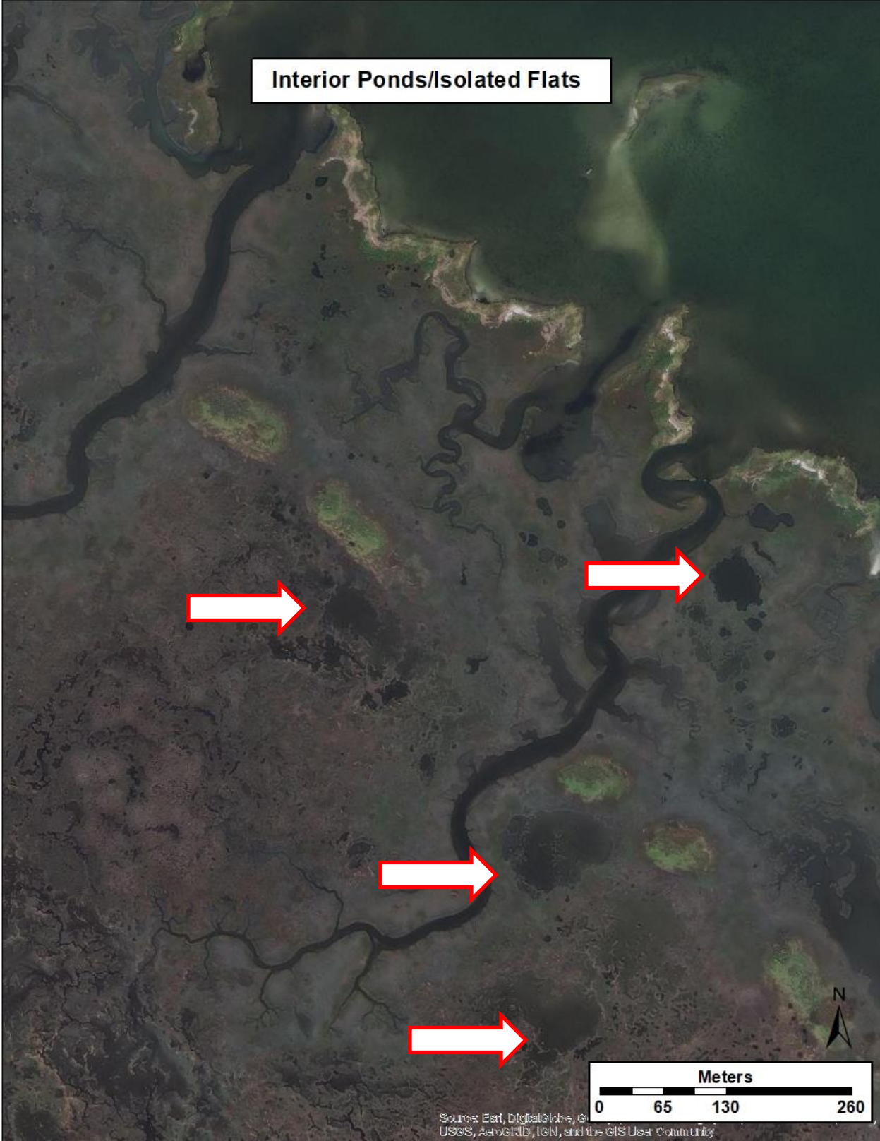
Figure 5. Examples of inland ponds and isolated flats.