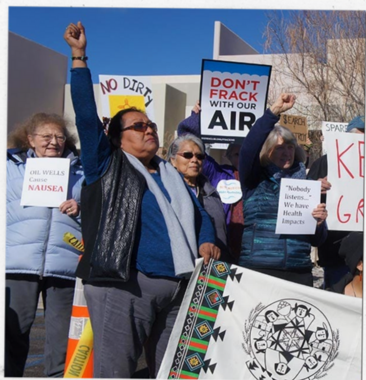
March 2018, Locals Protesting Health Hazards