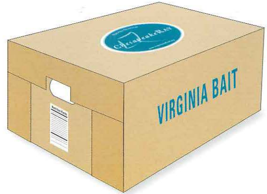
CHESAPEAKE RAY BAIT SHIPPING CARTON