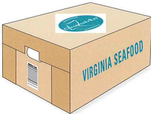
CHESAPEAKE RAY SHIPPING CARTON