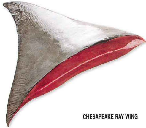
CHESAPEAKE RAY WING