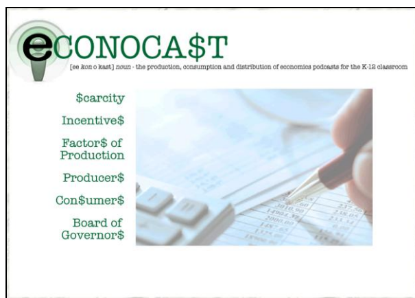
Figure 1. Screen shot of home page for web site.

We have developed the Econocast site to provide both a collection of economic podcasts for teachers to explore and a dedicated space to enable teachers to create their own podcast sites. For those wanting to browse existing podcasting projects, simply click on the “Consumer” tab on the website (see Figure 1). Finished projects can be searched by teacher name or by keyword.