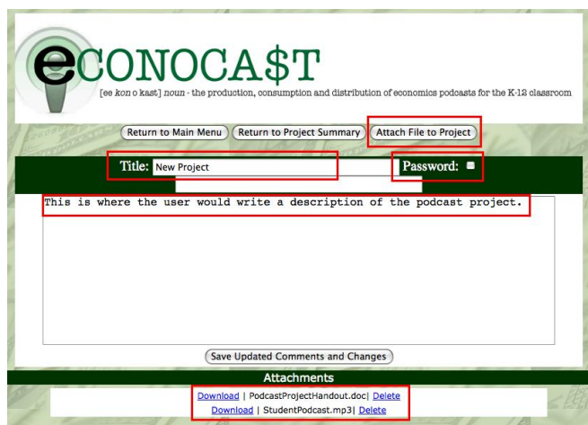
Figure 4. Podcast content.

on “Attach File to Project,” the teacher can upload any handouts she provided the students as well as all the audio files for project. By clicking on the “Password Check” box, the teacher can password protect the published podcast (see Figure 4).