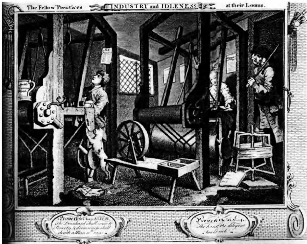
Plate 1: The Fellow Prentices at their Looms (1747)