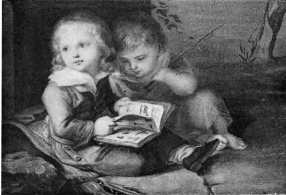
FIGURE 1 HAPPY AND CONTENTED