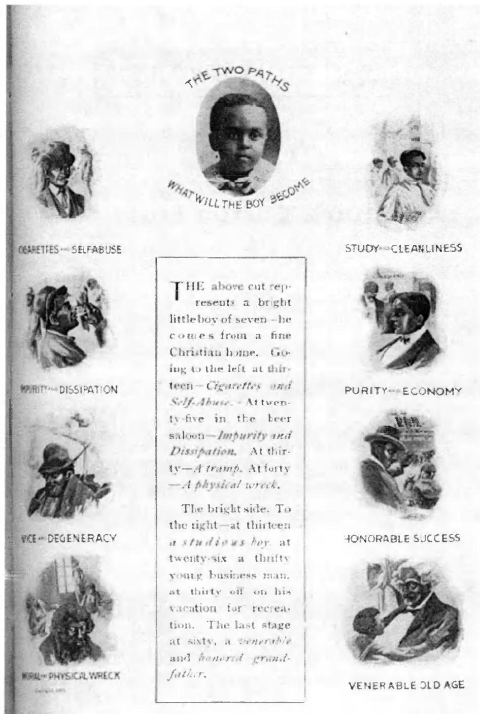
Plate from Golden Thoughts on Chastity and Procreation (1903)