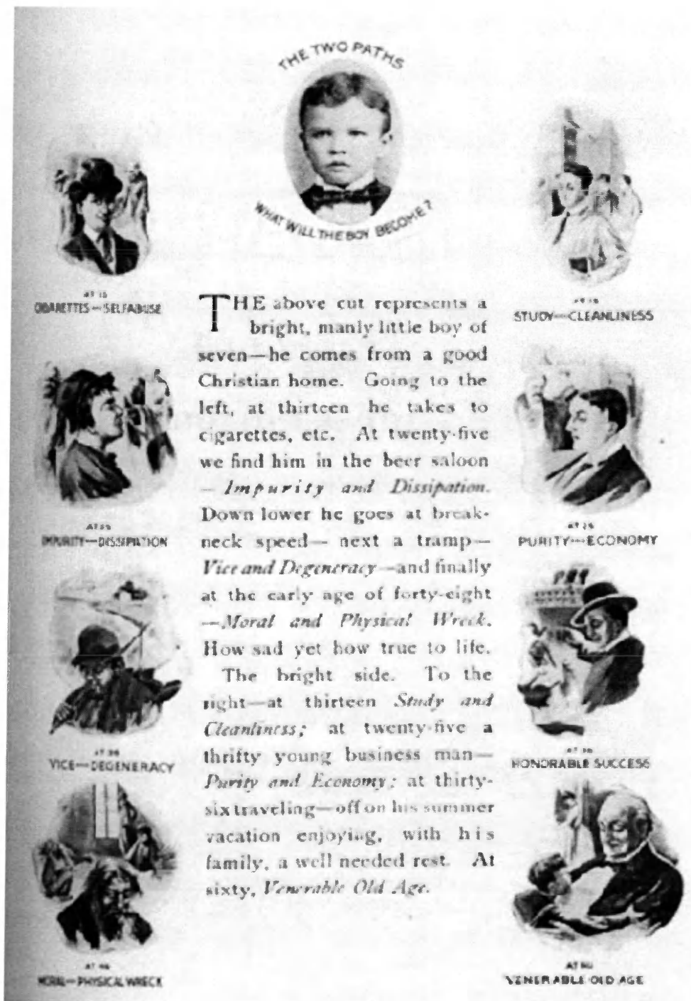
Plate from Social Purity (1903)