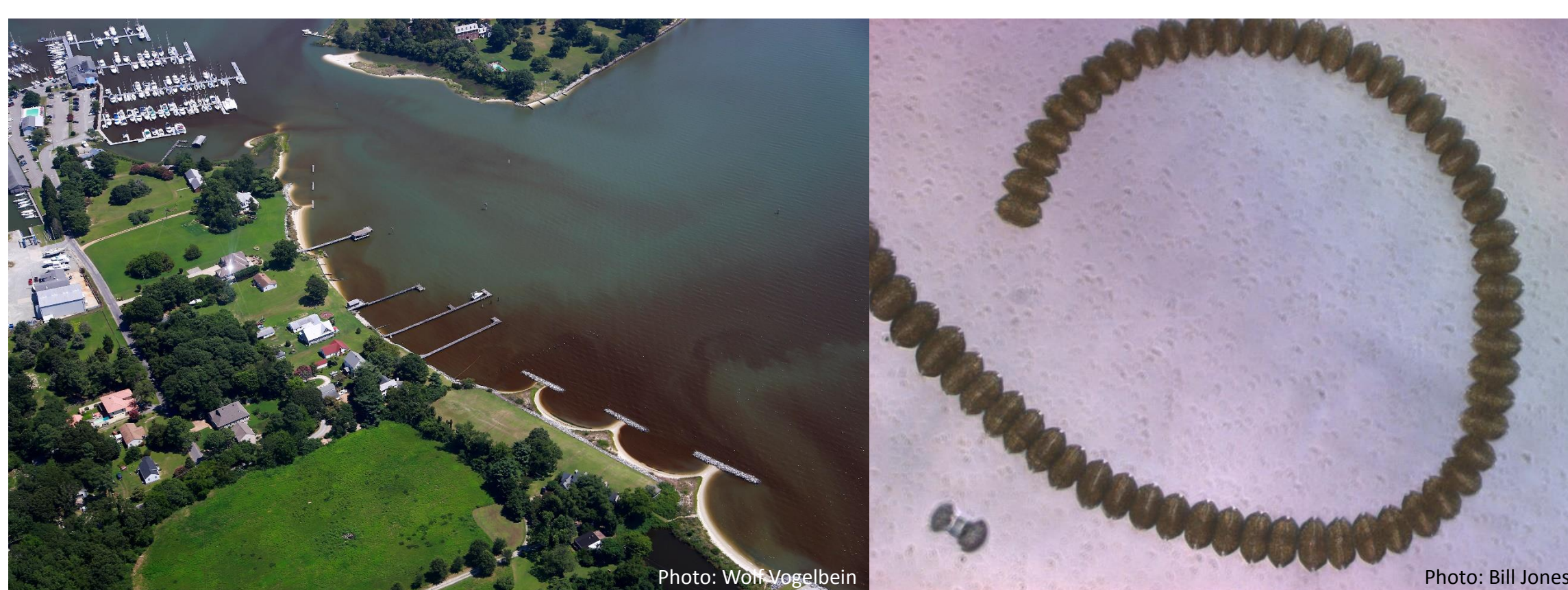
Figure 1. Left: Bloom of Alexandrium monilatum at the mouth of Sarah's Creek. Right: A chain of A. monilatum cells.