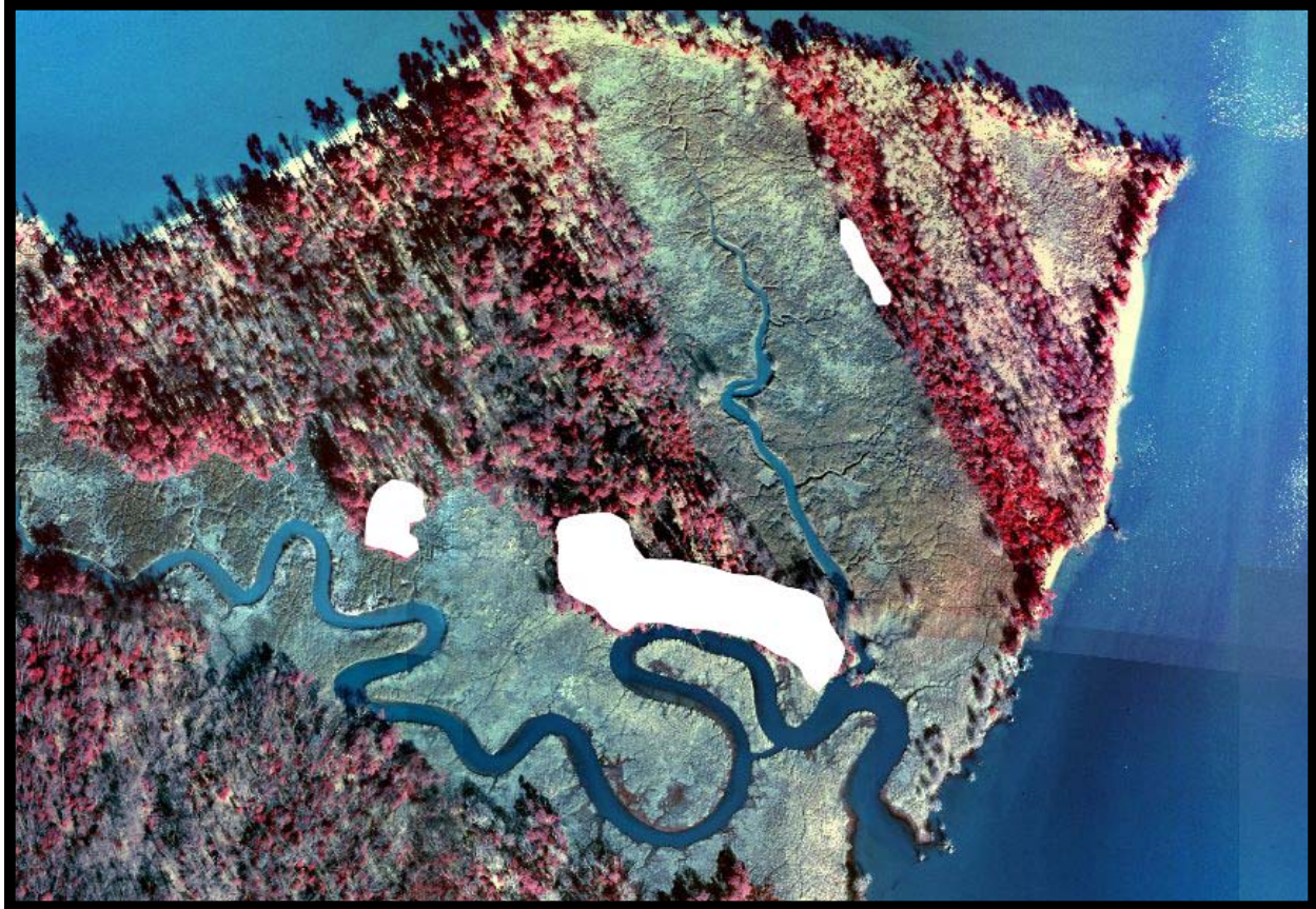
Figure 3. Location of colonies on Swanns Point. Colony boundaries are in white.

Swanns Point Colony: The Swanns point colony held steady between 2005 (55 pairs detected) and 2006 (56 pairs detected) but has declined substantially since the 2003 survey (135 pairs detected). The main colony is still largely centered in the mature pines of Black Duck Gut, but has shifted to the east and encompasses some of the mature bald cypress trees as well. The understory is open and very park like in the pine section of the colony, and quite swampy with an open understory in the section composed of cypress trees. A few nests were found to the northeast of the main colony and directly east of the main colony (See Figure 3 for a map of colony boundaries).