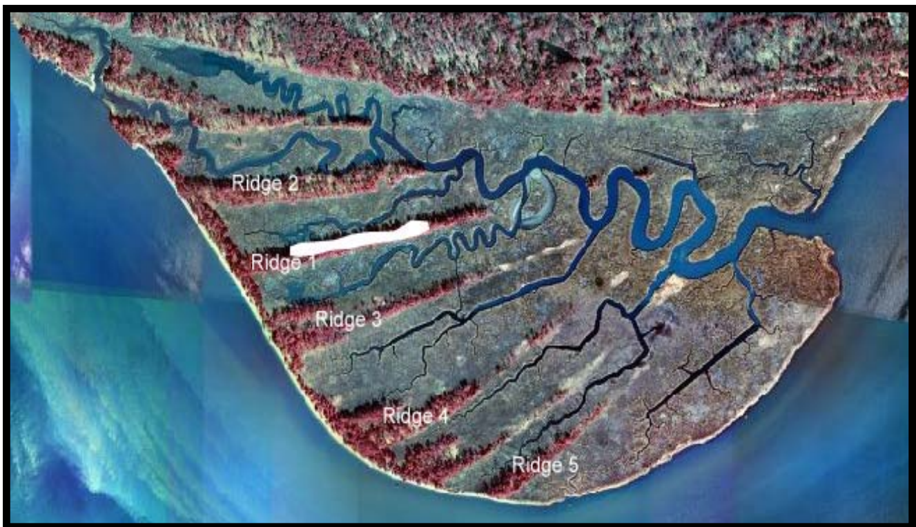
Figure 1. Location of the Great Blue Heron colony on Jamestown Island. Colony boundaries are in white. Ridges 2, 3, 4, and 5 formerly had breeding herons but in 2006 had no nesting herons.

brier and a thick wax myrtle shrub layer. Many of the large canopy trees on the ridge died during Hurricane Isabel in the fall of that year. The ridge due west from Ridge 1 has in the past contained heron nests (which we will refer to as Ridge 2). The Ridge 2 habitat is much denser than Ridge 1, with far more greenbrier and wax myrtle than Ridge 1. Ridges 3, 4, and 5 are smaller than Ridges 1 and 2 in both length and width and have a very dense understory layer. The Jamestown colony declined substantially during the past few breeding seasons, from 225 pairs in 2003, to 21 in 2006. This is due to a tendency of Great Blue Herons in recent years to nest in smaller, more isolated colonies (Watts, pers. com.). In 2006, the birds occupied 1 of 4 ridges occupied in 2003 and 1 of 3 ridges occupied in 2005.