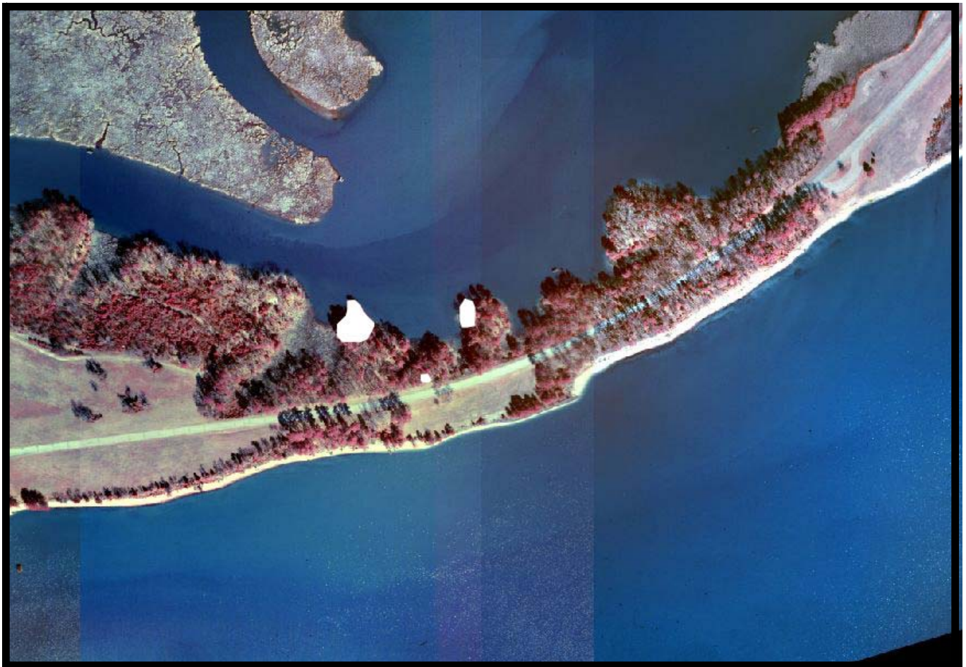
Figure 4. Location of College Creek heronry. Colony boundaries are in white.

College Creek Colony: The College Creek heronry has declined from a high of 22 pairs detected in 2003 to 11 pairs detected in 2006. The colony was first discovered during the 2000 survey. The colony remains spread across the tips of two shoreline points separated by a small tidal gut (See Figure 4 for a map of colony boundaries). The site is very near the Colonial National Historic Parkway, and one nest this year is in a loblolly adjacent to the CNHP.