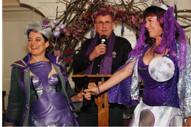
Figure 5: Beth Stephens (left) and Annie Sprinkle (right) at the altar of their Wedding to the Appalachian Mountains in Athens, Ohio (2010)