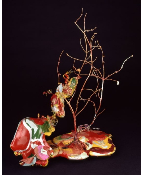
Figure 2: Charles Williams – Untitled , Lexington, Kentucky (1980s), tree branch and industrial plastic, image courtesy of the Souls Grown Deep Foundation

Charles Williams' Untitled is a small sculpture consisting of a multitude of commonplace materials. The sculpture is built around a slender end of a tree branch, with multiple forked twigs going in various directions. Blobs of multicolored, seemingly fluid melted plastic surround the base and higher levels of the branch, holding it upright. Along with the branch, these puddles of paint and industrial plastic contain a few small objects, the most recognizable of which are two small painted leaves towards the front of the sculpture and a discarded bike reflector towards the rear. Such a sculpture would be commonplace in both Williams' house and yard, which were filled with similar creations. In both the sculpture as a discrete object and as one of many objects in Williams' larger built environment, Untitled embodies the assemblage of Williams' gender and sexual identities and the ways in which these identities further intersect with the natural world and human institutions. The sculpture itself is quite literally a