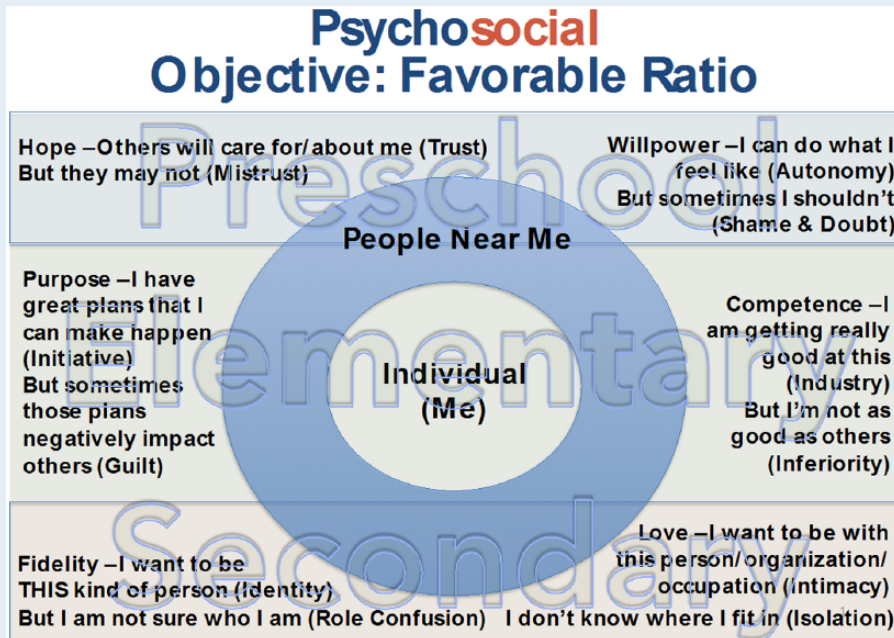
Figure 1. Conceptualizing the SPCM.