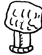
Capped with core of saw- dust paste